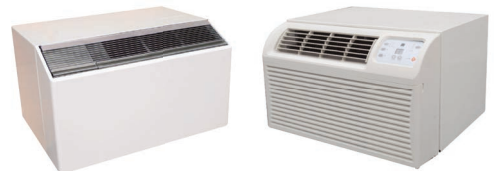
Direct Replacement for McQuay Models Available