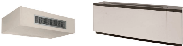
Self-Contained, Heat Pump and WSHP Floor Units