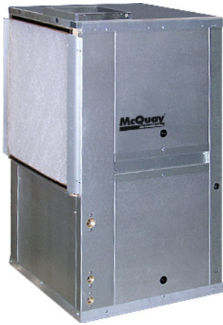
Enfinity™ high efficiency vertical water source heat pump with HFC-410A refrigerant

This is integral to all of our designs for the past 10 years; it's a keystone for making these systems more energy efficient."